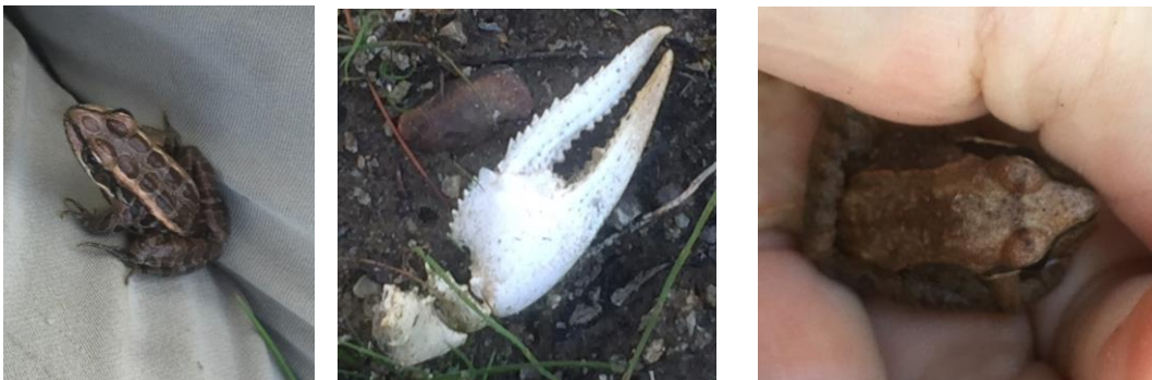
Figure 27, 28, and 29: Aquatic and semi-aquatic wildlife of Woodchuck and Tucker mountains. A leopard frog and crayfish clay from man-made ponds (left, center). A wood frog caught upslope in the forest above Tucker Mountain Road (right).

“Man-made Ponds”: I visually surveyed both ponds for signs of wildlife. A great blue heron’s track traced a similar route along the margins of the pools. Both ponds showed signs of old beaver activity, but seemed to have been abandoned by the large rodent a number of years ago. A large snag next to the lower pond presents an ideal perch for raptors. I glimpsed numerous crayfish and salamanders from the bank, woefully unable to catch or identify members of either taxa. Diving beetles and small fish moved in frenetic schools. I managed to catch and identified one leopard frog.