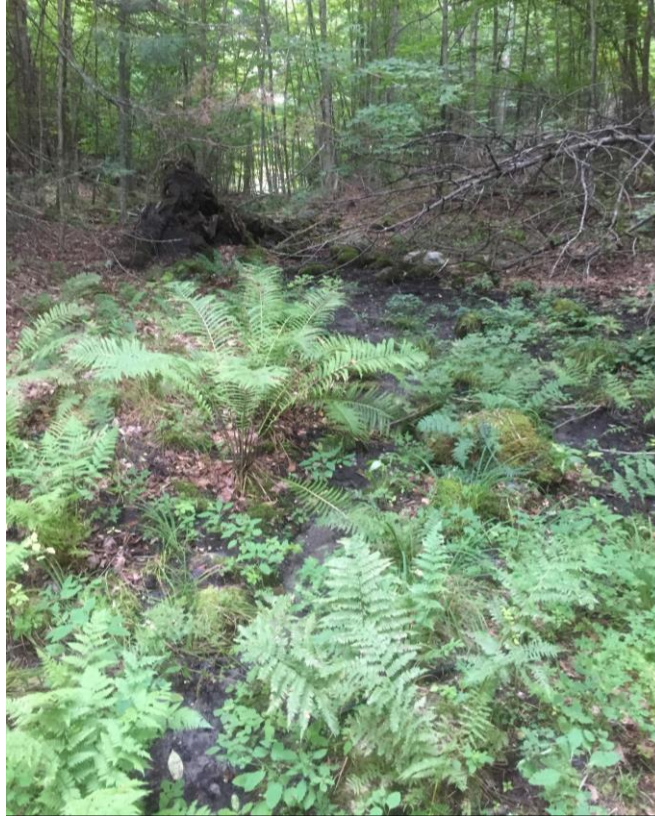
Figure 15: “Southwestern Seep”

This gentle depression is surrounded by sugar maples and large-diameter white ash. Cinnamon fern, jewelweed, and sensitive fern blanket sodden, mucky substrate. This seep is within view of the Red Maple-Black Ash swamp and a human-enhanced pond on an adjacent property. There are black pipes running up from this pond, one to a springbox within the boundaries of the Leach parcel and another further upslope into the margins of this seep.