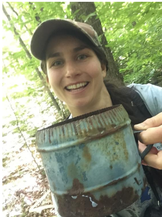
Figure 38: Here’s to the new Newbury Town Forest!

Finally, this land enriches the living history of the Upper Connecticut Valley with the stories contained in its stone walls and towering maples. Based on social media, Vermonters venture out nearly every fair-weather weekend to enjoy the mountaintop scenery on Tucker Mountain. Situated at the confluence of social and ecological benefits, the proposed Newbury Town Forest is a project worthy of statewide support.