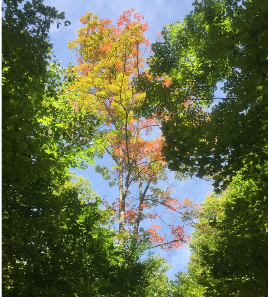
Figure 6: A window into the Northern Hardwood Forest matrix natural community.

I designated natural communities based on the Thompson and Sorenson's formative text: Wetland, Woodland, Wildland (2002). In the next section, I offer stand descriptions to capture the variability of distinct zones of vegetation at a finer scale.