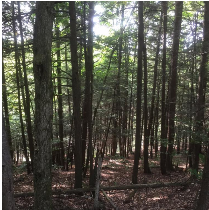
Figure 9: Only a little light filters through the hemlock-dominated overstory

Eastern hemlock becomes more prominent than hardwoods on the lower western slopes of Tucker Mountain. Beech, maple, oak and birch still appear among the softwood. Only a few ferns dot the shady forest floor. The canopy is effective at filtering out snow in addition to light, and deer take advantage of this moderating effect in harsh winter conditions.