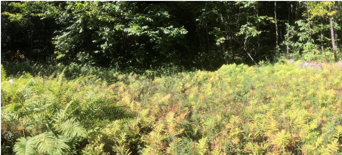
Figure 13: “Northern Seep”

In each of the seeps, sedges, bryophytes and ferns are well-represented. A thorough trip during the peak flowering season would likely yield a far more detailed species list at each of these locations. Beyond floristic diversity, ground-water kept at a near-constant temperature above freezing year-round which supports vegetation beyond the bounds of the typical growing season. Bears make use of this early-spring source of welcome nourishment (Thompson and Sorenson 2002). Despite similarities, each of these seeps is distinctive in topographic position or associated plant community. I have described them based on their location on the Woodchuck and Tucker Mountain properties. I also make mention of any threats I observed near these resources.