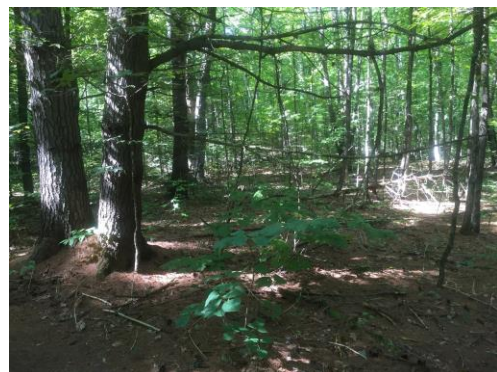
Figure 26: Looking through the open mid-story of a white pine stand into the thick green of mixed-age hardwoods.

“Old Fields”: Stands of white pine form a patchwork within the hardwood matrix north of Tucker Mountain Road. Oriented along stone walls and next to signs of old road corridors, these patches were likely once fields or pasture, hinting at the former order imposed upon the now-forested landscape.