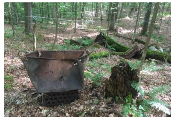
Figure 8: Sugaring then and now

On the northern boundary of the Woodchuck Mountain parcel, I encountered one undeniable example of a Rich Northern Hardwood Forest. Here, wood nettle and maidenhair fern carpet a shallow north-facing depression. Just over, or perhaps intermingling with the property boundary, long tubes wick away spring sap destined for pancakes. Evidence of maple sugaring seasons long past is close at hand in an assortment of rusty metal objects.