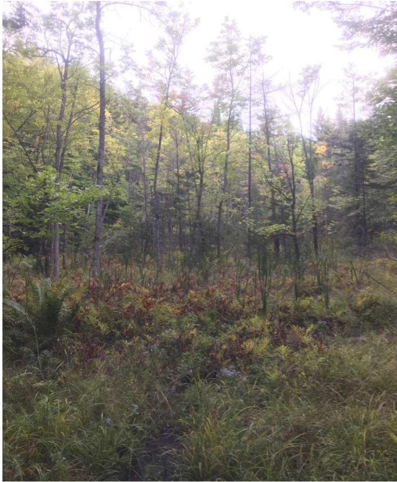
Figure 10: A swamp in the last hour of daylight

A few red maples and black ash poke up through sedges and ferns in this small opening in the forest. Sensitive fern and sedges ( Carex spp.) are abundant interlaced with cattail. Swamp saxifrage and cinnamon fern also grow out of muck. The swamp is not far from a house and human-enhanced pond just over the property line. This area may see more use because of this nearby entry point. In addition to porcupine footprints, all-terrain vehicle tracks were seen at the end of the swamp (Figures 11, 12 below).