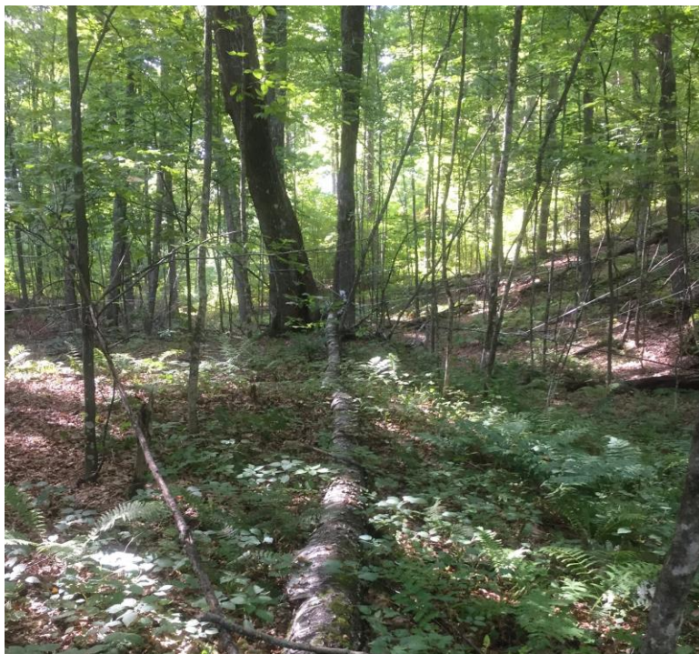
Figure 7: Dense herb layer under sugar maple-dominated canopy.

On the northern boundary of the Woodchuck Mountain parcel, I encountered one undeniable example of a Rich Northern Hardwood Forest. Here, wood nettle and maidenhair fern carpet a shallow north-facing depression. Just over, or perhaps intermingling with the property boundary, long tubes wick away spring sap destined for pancakes. Evidence of maple sugaring seasons long past is close at hand in an assortment of rusty metal objects.