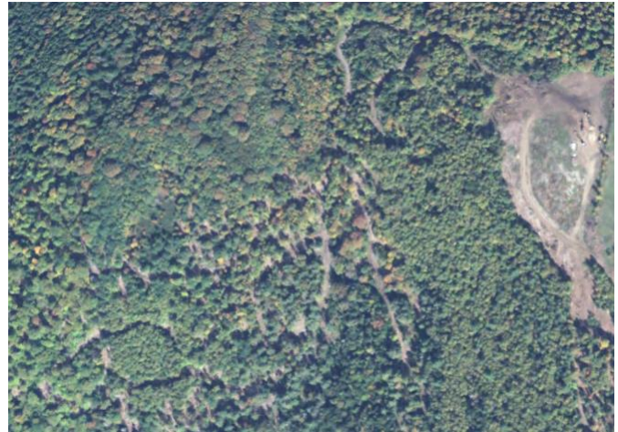
Figures 24 and 25: Aerial photo from 2009 (left) and from 2010 (right). Tucker Mountain Summit visible on the right-margin of both photos. Though older logging corridors may be seen in the first photo, they are greatly expanded in the second photo.

“2010 Clear Cut”: A few acres of forest in the extreme western portion of the property were clearcut in 2010. Blackberry and white pine seedlings grow vigorously here. Two large white pines were left as seed sources in the cleared area, and a large open-grown sugar maple lingers on the forest’s edge.