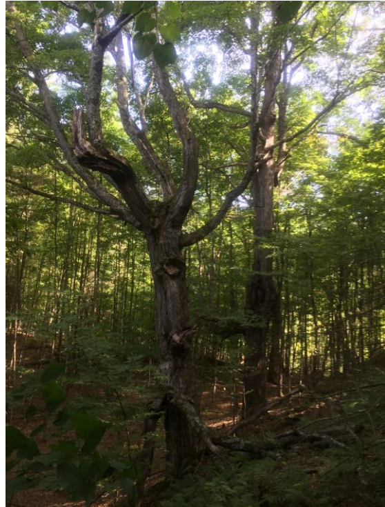
Figure 30 and 31: A long-standing property boundary is clearly delineated by long-standing maples (left) and two such maples towering above younger forest cohorts (right).

“Monarch Maple Stand”: In this zone, pole-sized maples and other scattered hardwoods surround occasional canopy-dominant behemoths. Most of these are sugar maples, but there are also a few gargantuan basswood and red oak. Though only a handful of the legacy trees are captured within property’s boundaries, they are nonetheless one of the most alluring aspects of the entire ~200-acre area. The tree featured on the cover of this report has a hollow base spilling over with porcupine droppings, and many of the other trees are partially rotted at the base with occasional dead limbs and numerous cavities. These decadent features are valuable to a host of wildlife species, and enhance the unique character of the larger stand.