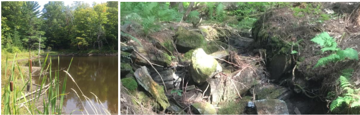
Figure 2 and 3: Upper manmade pond (left) and intermittent brook on southern property line (right).

In between Woodchuck and Tucker mountains, there are two human-created ponds. Flowing westward to fill these pools, the headwaters of Meadow Brook escape through small culverts beneath earthen dams. Another intermittent brook surfaces briefly on the southern boundary of the property to join Meadow Brook further downstream. Meadow Brook eventually empties in the Waits River which flows into the lengthy Connecticut River. The eastern portion of the proposed town forest flows into Hall's Brook (see Phillip's parallel report). I identified five forest seeps on the property and one swamp; these wetlands are discussed in detail in the Natural Communities section of this report. It is important to note that I encountered these features in mid-September of a drought year; I would expect these wetlands would swell in size and that more water would flow in the brooks under more typically moist conditions.