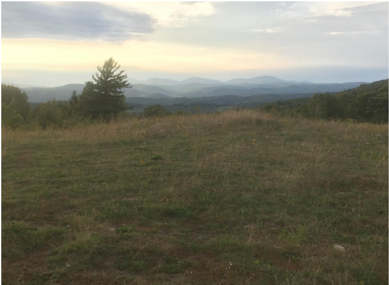
Figure 1: View from the summit of Tucker Mountain west towards the Green Mountains.

Tucker and Woodchuck Mountain rise above the Connecticut River Valley near the transition between the Northern and Southern Vermont Piedmont biophysical regions. The Vermont Piedmont is characterized by abundant lower elevation hills and split into two regions based largely on climatic differences (Thompson and Sorenson, 2000). Situated astride the boundary between the cool, northern Piedmont region and the warmer southern zone, temperatures on Tucker and Woodchuck Mountain are moderate when compared with the rest of the Vermont. The wooded summit of Woodchuck Mountain, at 1,739 ft., peaks above the 1,690 ft. mowed lookout atop Tucker Mountain. This lower summit slopes towards Meadow Brook, reaching a low point of 1,200 ft. in the southwestern corner of the property.