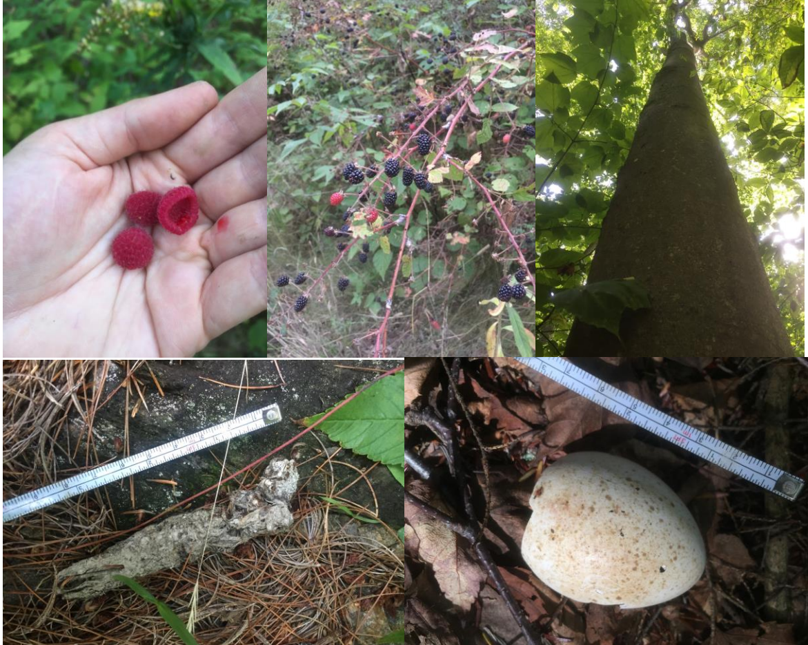
Figure 32, 33, 34, 35, and 36: Examples of delectable soft mast (top left, top center) and looking up the trunk of an American beech (top right). Canid scat (lower left) and large egg (lower right).

In terms of potential bird habitat, several species of neotropical migrants including the chestnut-sided warbler and common yellowthroat benefit from forest canopy gaps (Hagenbuch et al. ). In addition, cavity-nesting species will find ample standing dead snags on this property. Upslope of the 2010 clear-cut, I found an eggshell large enough to suggest it came from the depredated nest of a buteo, turkey vulture or possibly turkey.