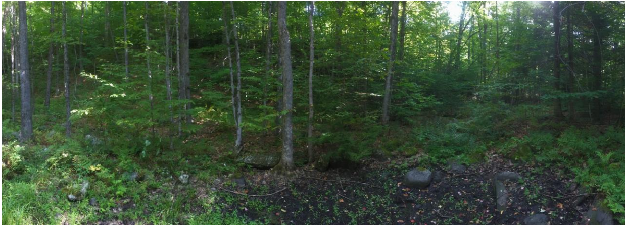
Figure 14: “Mid-slope Seep”

A bedrock ridge makes a horseshoe around this secluded seep. Sugar maple and white ash are present in an open canopy that shades a lush growth of cinnamon and sensitive fern. A round depression of bare muck, three meters in diameter, appears to hold water for much of the season, and as a result, this habitat feature may be important to amphibians. This seep extends down slope linearly until reaching the road and intermittent brook. Raccoon and deer tracks crisscross this narrow zone, while marsh fern and interrupted fern are scattered along its margins.