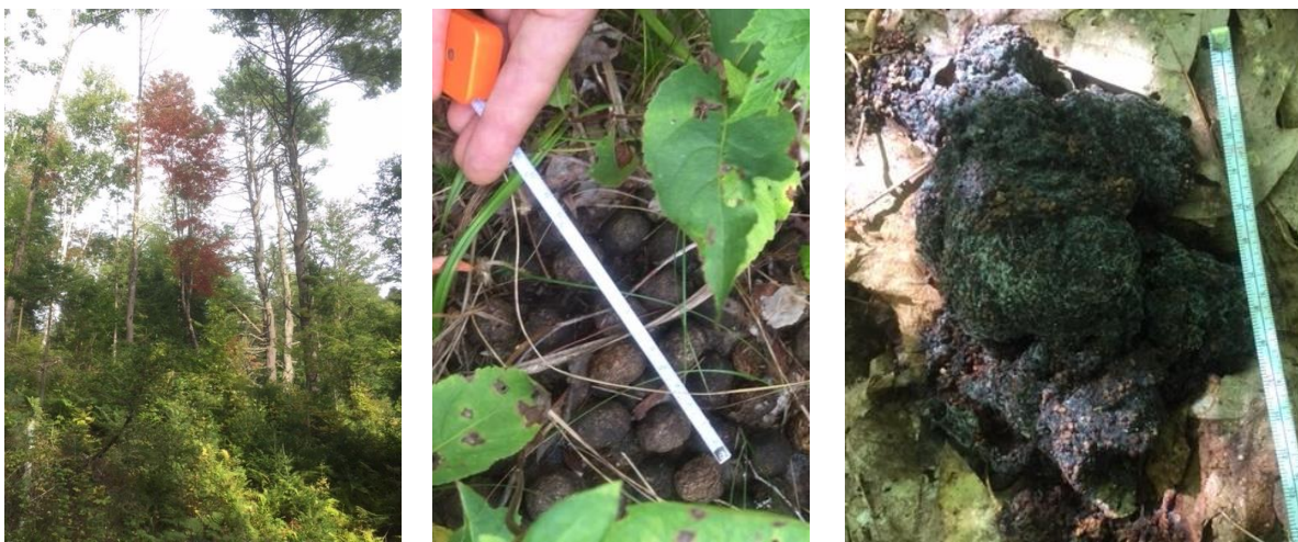
Figures 21, 22, and 23: Large pines and maples standing above regenerating forest (left), moose droppings (center) and berry-laden bear scat (right).

“Recent Forest Treatments”: The majority of the Tucker Mountain Parcel was selectively logged using old older skid roads sometime between 2010 and 2012. Much of this area experience earlier forest treatments in the early- to mid-1990’s. Many large white pines, sugar maples and red oaks have been left standing. A younger, dense-grown cohort of red maple, paper birch, and other hardwoods was also left to grow in patches. The lanes in between these shrubby forest are thick with blackberry, bracken fern and hay-scented fern. I found bear and moose scat in these zones.