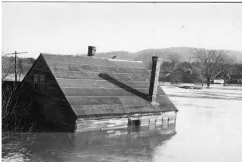
Figure 38: The site of the Bradford-Piermont bridge, swept away by the Waits River on Nov. 4, 1927. Meadow Brook, with its headwaters situated between Woodchuck and Tucker mountains, flows into the Waits River upstream of where this photo was taken.

Beyond their specific flora and fauna, Woodchuck and Tucker Mountains contribute to the surrounding landscape through the ecosystem services they provide. An undeveloped and largely forested set of mountains makes the larger watershed more resilient to flooding than the same area developed and partially covered in non-permeable surfaces. Though nearly a century has passed since the devastating floods of 1927, residents of the Upper Connecticut River Valley can anticipate flood conditions to reappear over the next one hundred years. When considering the potential Town Forest, flood mitigation and the carbon sequestered by well-managed forests are two public goods that should not be ignored. The specter of climate change joins in as an unignorable entity in the Newbury Town Forest discussion. The natural communities and vegetation zones I have documented on the site can be expected to change over the coming decades, and management activities will have to adapt accordingly.