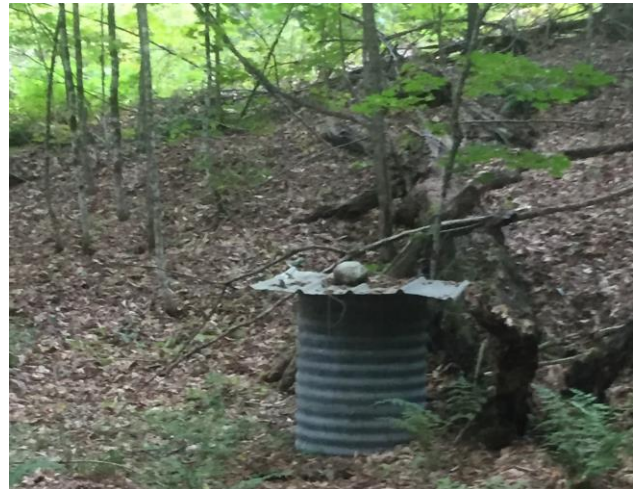
Figure 15 and 16: Black pipes and springbox within the Leach property boundaries.