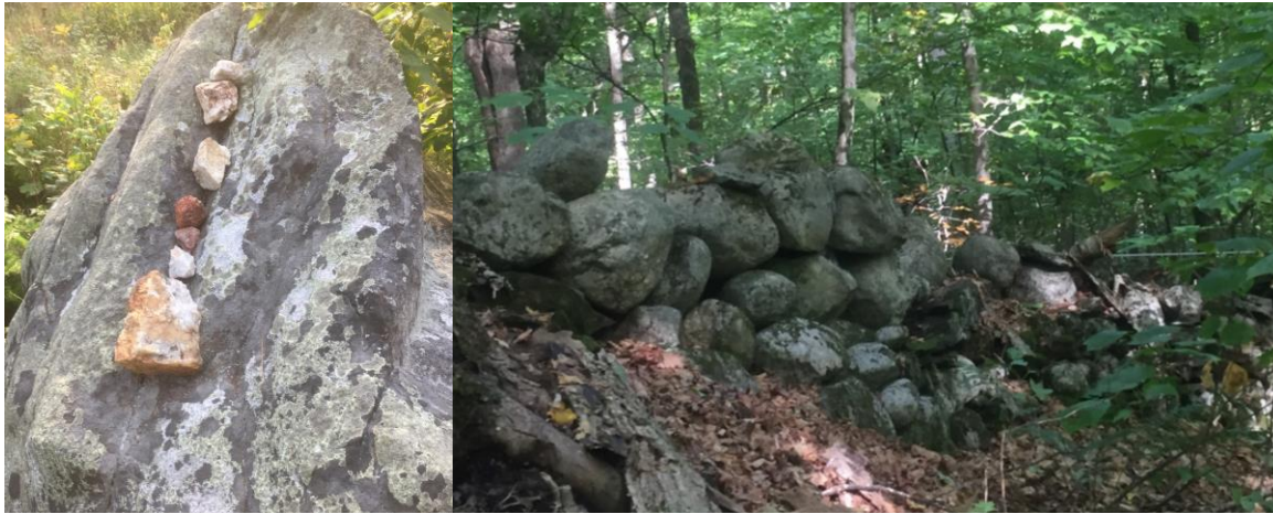
Figures 3 and 4: A visitor-compiled “museum” of distinctive rocks (left) and a section of stone wall running through the forest (right).

Much of the properties' bedrock lies concealed by material of a far younger geologic vintage. Tens of thousands of years ago, the Laurentide Ice Sheet paved its progress and eventually its last retreat in a jumbled mix of boulders, rocks, and much smaller particles. The glacial till that covers the majority of Woodchuck and Tucker Mountain likely played a role in the site's human history as a source for stonewalls and agricultural headache. A multiplicity of origin sites can be detected amongst the glacier-borne debris—for example, the granites and chunks of rosy quartz are unlike any of the onsite bedrock types. I also encountered several refrigerator- to car-sized glacial erratics on the property.