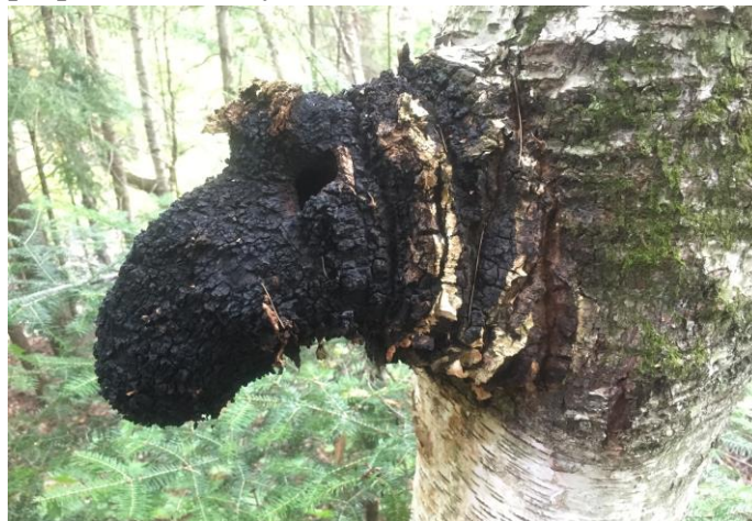
Figure 37: A particularly large chaga fungus growing from a paper birch.

Along with hiking, wildlife viewing, hunting, and ATV-riding, visitors to Woodchuck and Tucker Mountains will find ample opportunities to foraging. Within my one-day visit, I encountered lobster mushrooms, king boletes, and chaga fungus in addition to the heavy berry crop. Judging by the $30/pound price tag for lobster mushrooms at a downtown supermarket, the harvest of forest products might join silviculture and maple sugaring on the list of potential future "working uses" of the proposed Newbury Town Forest.