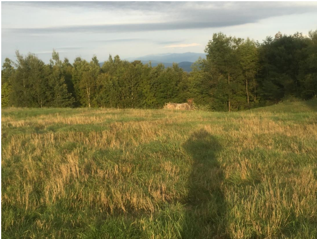
Figure 17: View from of the White Mountain from Tucker Mountain

The following zones do not fit neatly into the natural communities concept. Nevertheless, I cannot paint a complete ecological picture of the site without describing the distinct character of each.