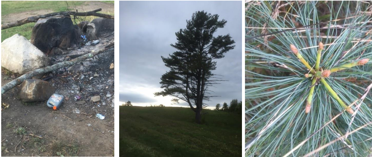
Figures 18, 19 and 20: Party debris around a large fire ring (left), a large white pine “wolf tree” (center) and a young white pine seedling joins the open-grown ranks(right)

Aesthetically, the cleared mountaintop offers some of the finest Vermont views. The forested peak of Woodchuck Mountain, though slightly taller, conversely leaves everything up to the imagination. At this point, generations of Newbury residents have maintained the beloved Tucker Mountain vistas. There is clear evidence, however, of this being a tough love at times; the Beer Bottle-Cigarette Butt unnatural community is never far from sight in the foreground of lovely mountainscapes.